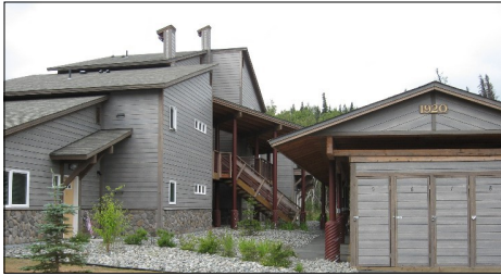
ONE BEDROOM 1 BATH 816 SQFT