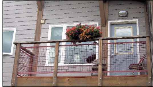
TWO BEDROOM/1 BATH 912 SQFT